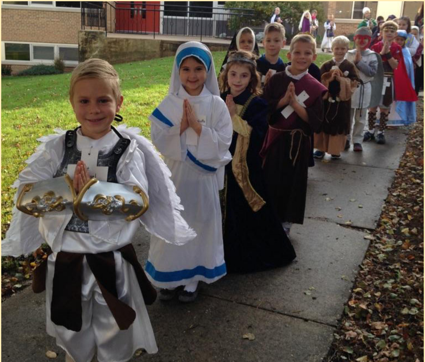
Tuesday, November 1st, our First Graders Celebrated All Saints Day at the 9:30 AM Mass.